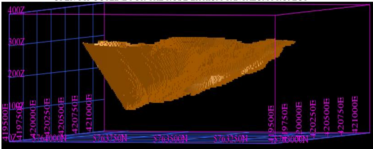
OPEN-PIT OUTLINE FOR THE ROSE LITHIUM-TANTALUM PROJECT

The following figure shows an isometric view of the open-pit outline retained for the PEA. The total amount of material to be mined is estimated at 193 Mt, consisting of 24 Mt of ore and 169 Mt of waste, for a stripping ratio of 7:1. Mining equipment will include down-the-hole ("DTH") drill rigs well suited to large-scale production work and capable of drilling holes ranging from 110 to 203 mm in diameter. 33-tonne hydraulic shovels and 27-tonne backhoes will be used to load ore and waste into 150-tonne trucks. The proposed pit will be approximately 1.8 km long by 0.8 km wide.